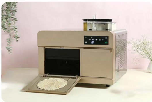
Figure 2: Proposed Fabrication of Automatic Roti Maker Using Motorized Press

Overall, the automatic roti maker using a motorized press represents an innovative advancement in kitchen technology. By combining efficiency, ease of use, and consistent quality, the system will address the growing need for time-saving kitchen appliances. It will simplify the roti-making process, offering a practical and efficient solution to an everyday task while maintaining the traditional taste and quality of freshly made rotis.