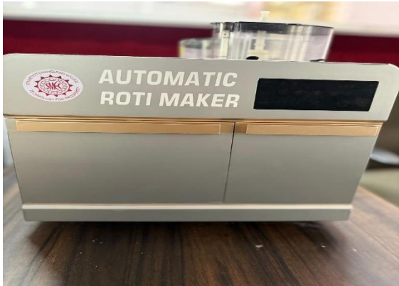
FIGURE 3 : Automatic Roti Maker

In conclusion, the experimental analysis will be a critical step in validating the effectiveness of the automatic roti maker using a motorized press. By testing key components and evaluating operational efficiency, the analysis will help ensure that the system meets the desired standards of quality, performance, and user satisfaction. The outcome of this phase will provide the necessary information for fine-tuning the system and making it ready for practical implementation.